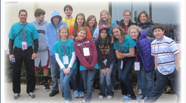
Youth and adult leaders from Missouri UMC travelled to Springfield on January 21 & 22 for WOW 2012, a weekend of praise, learning and fellowship.

6:30-7:30pm - Youth Activities (Room 306)