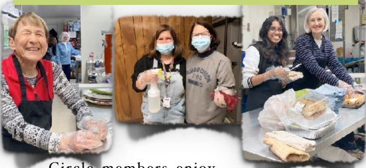
Searcy-Feely members & some of the Neighborhood students serving for Loaves & Fishes.

Circle members enjoy serving MUMC in a variety of ways. As part of the program for the November meeting , members polished brass pieces for the sanctuaries: candle sticks, crosses, and offering plates.