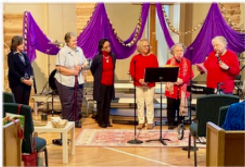
(Listed from right to left)