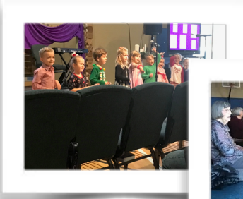
Discovery Day students performing for UMW members

The December MUMC Unit Meeting was held on December 1, 2021 in the Multipurpose Room of the CLC. The delightful entertainment was provided by the Discovery Days students.