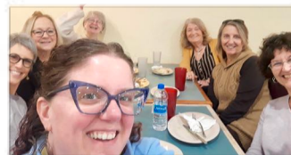
Happy coincidence.. Lunch before working/meeting at church...