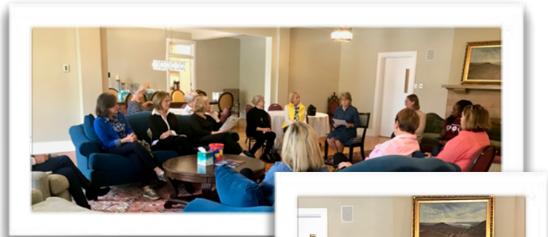
Wesley Circle meeting in the MUMC Parlor