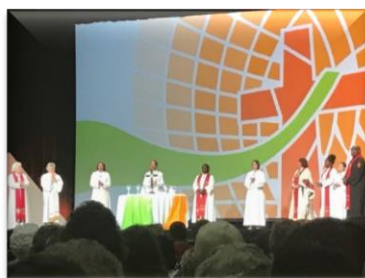
Women Bishops and one male host