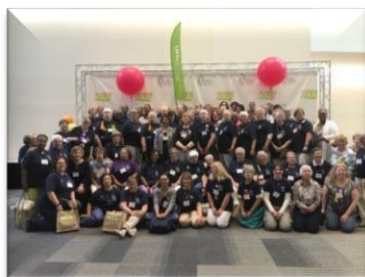
Attendees from MO Conference