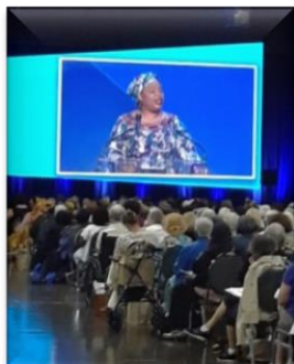
Leyman Gbowee Liberian freedom fighter and 2011 Nobel Laureate