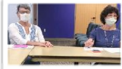
Masked & socially distanced but united in fellowship!