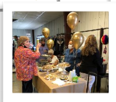
Volunteers and customers celebrate 51 years of service!