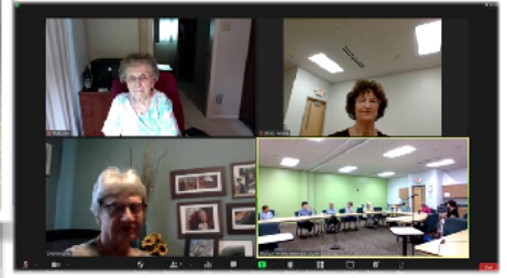
Zoom Meeting attendees

Searcy-Feely Circle doesn't have regular meetings during the summer months, but did serve 125 meals at Loaves and Fishes on a hot July evening.