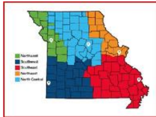
New District Map (North Central)