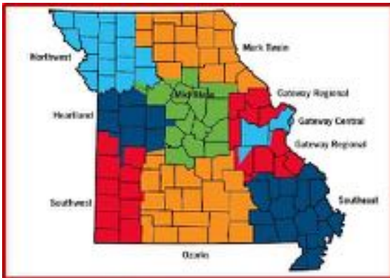
Old District Map (Mid- State)