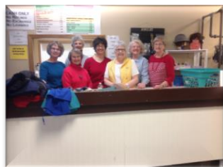
Searcy-Feely at the Wardrobe 2/28/18